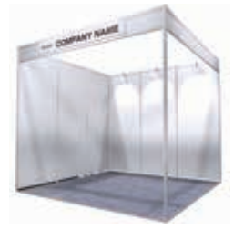
Rental stand Basic type (Corner booth Image)